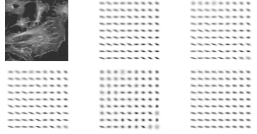
Fig. 3: Kernels identification using Cells image with 8 \times 8 overlap: noisy blurry images (top-left); original kernels generated using model from [2, Fig.7] (top-middle); restored kernels with BPF (top-right), BPF-BS (bottom-left), IS (bottom-middle) and MAP (bottom-right).

In the second setup, the scale and orientation parameters of the kernels are generated using realistic optical models. Two spatially variant models described in [23, Fig.8] and [2, Fig.7] are tested. Small random perturbations are added in the parameters of the evolution laws explaining the spatial variation of the PSFs to better represent the variability one can experience in a true acquisition device. Regarding the patch